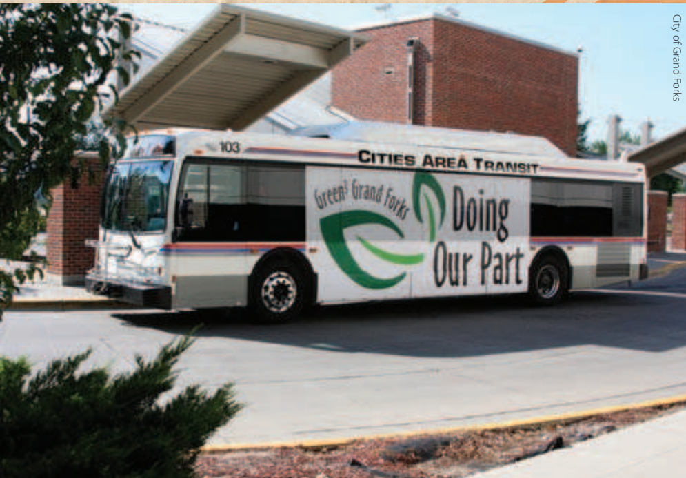
City of Grand Forks

The Mayor's Green 3 Initiative features hybrid buses that burn less diesel fuel, alternative energy choices and a strong focus on recycling and protecting our environment for generations to come. The city has even reprogrammed traffic lights throughout Grand Forks, to keep traffic moving and allow vehicles to use less fuel.