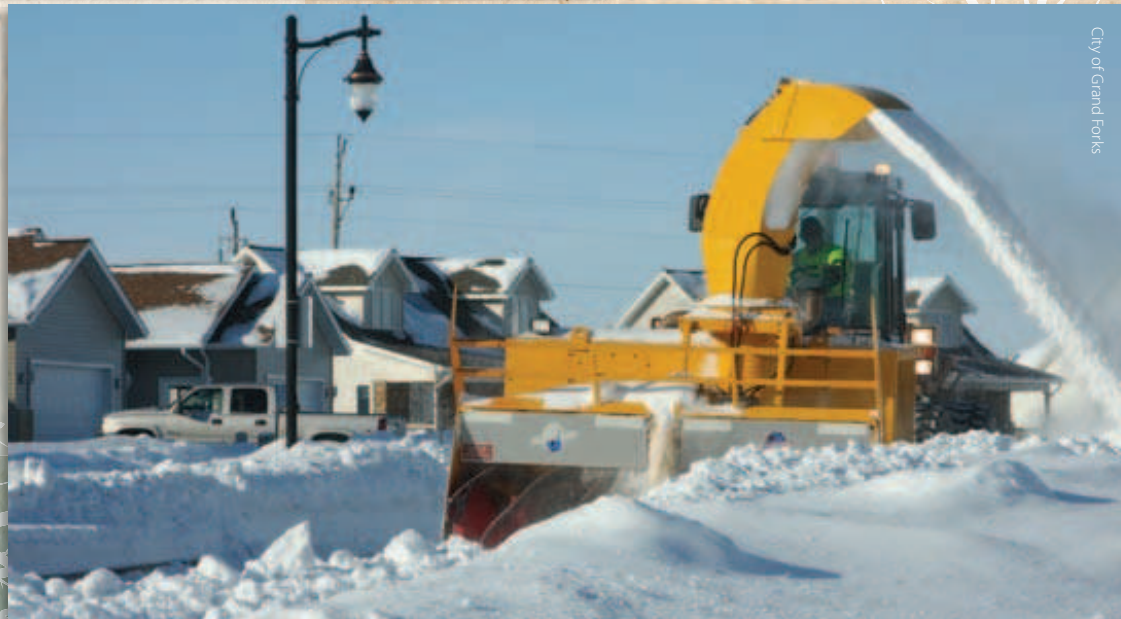
City of Grand Forks

The City of Grand Forks has more than 700 miles of streets, alleys and trails throughout town that must be cleared when the snow falls. And the streets crew makes quick work of it – normally they can have everything open to traffic within 24 hours. Make sure to observe the street maintenance schedule that's in effect year-round to avoid having your vehicle plowed in or ticketed.