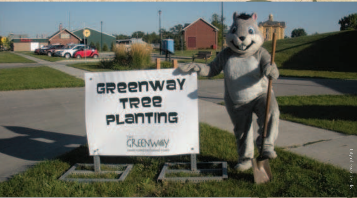
City of Grand Forks

May brings graduations, green grass, the planting of gardens and trees and most of all – peace of mind. The City of Grand Forks is protected by a $412 million flood protection system that helps keep our homes, businesses and families safe from floodwaters of the Red River. The system, which includes a series of levees, floodwalls, pump stations and diversion channels was certified by the US Army Corps of Engineers in 2007. Since that time, it has protected Grand Forks from the third and fourth highest flood levels in history.