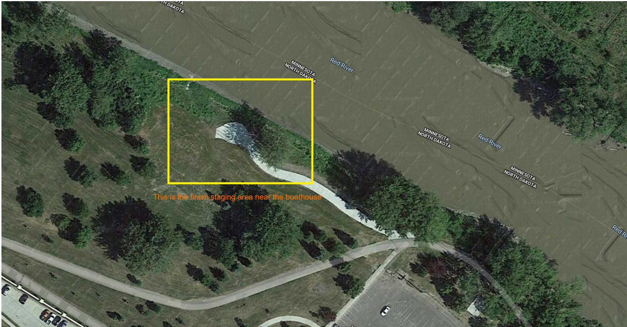
This is the finish staging area near the boathouse