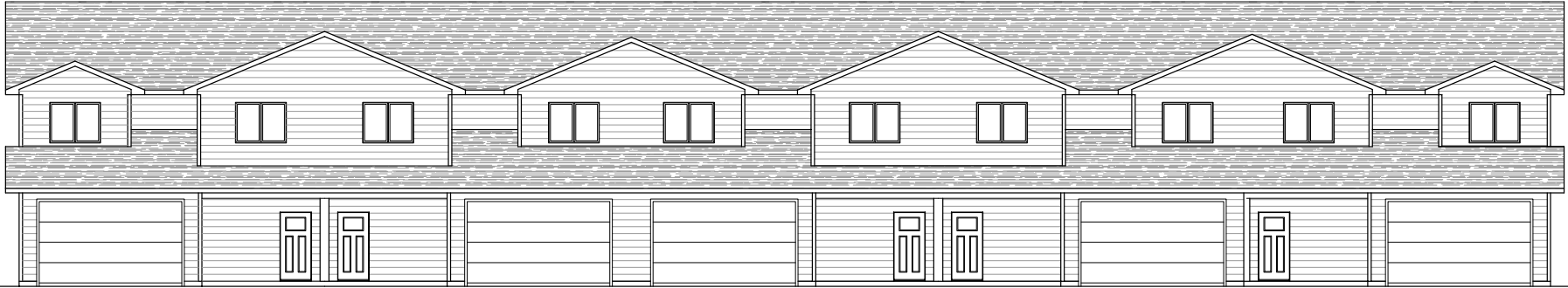
2 FRONT ELEVATION 3/32" = 1'-0"