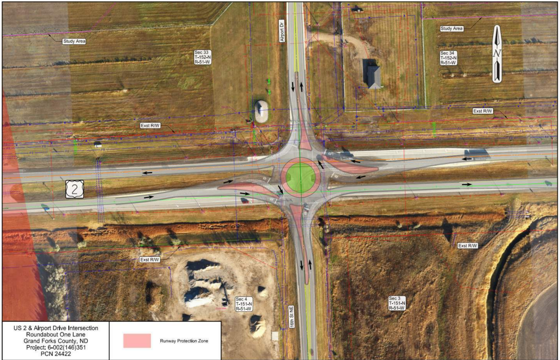
Figure 2 - Alternative B: Roundabout Single Lane