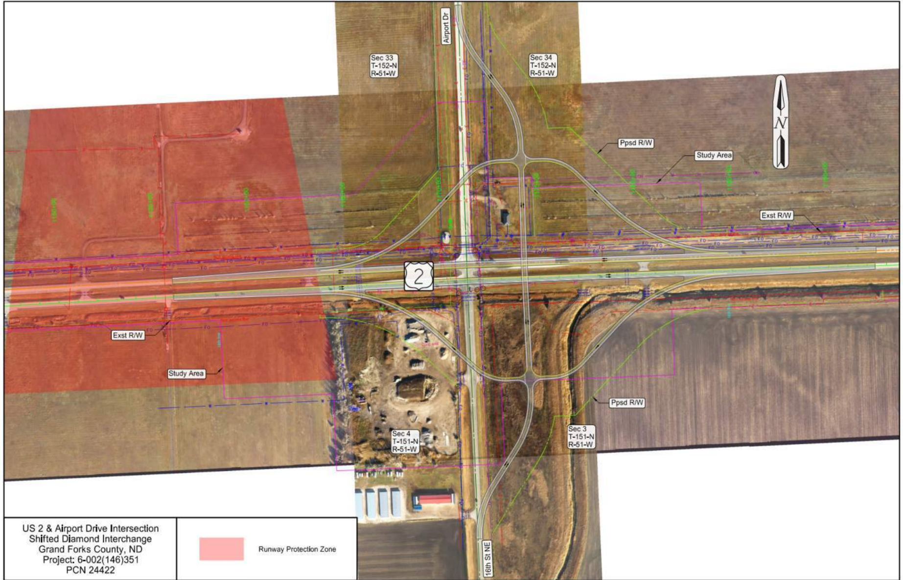
Figure 4 - Alternative D: Shifted Diamond Interchange