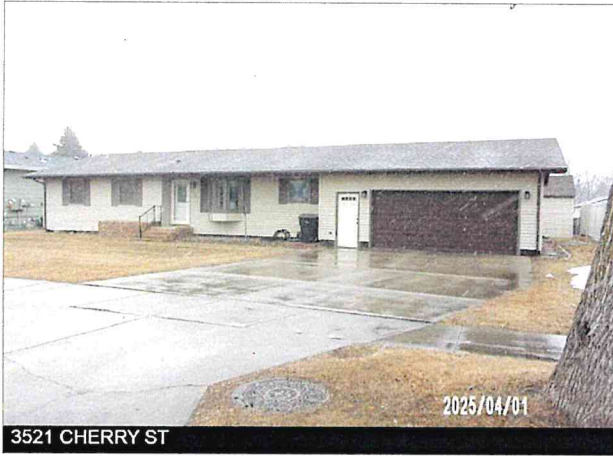
1. 3521 Cherry St 44.2923.002.00