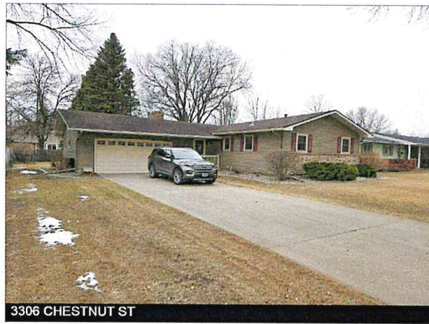
2. 3306 Chestnut St 44.291344.032.00