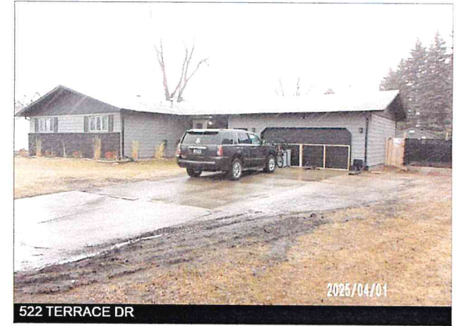
3. 522 Terrace Dr 44.2913.101.00