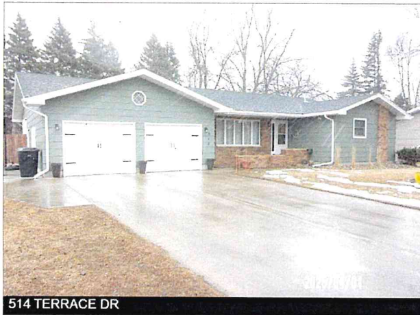
4. 514 Terrace Dr 44.2913.100.00