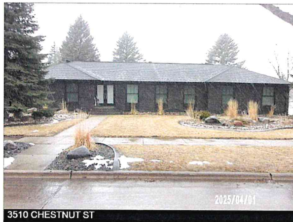
5. 3510 Chestnut St 44.2913.092.00